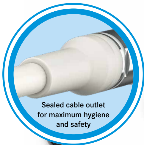
Sealed cable outlet for maximum hygiene and safety